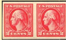
533 VF NH Pair

Scott No. Description Brookman Retail Sale Price