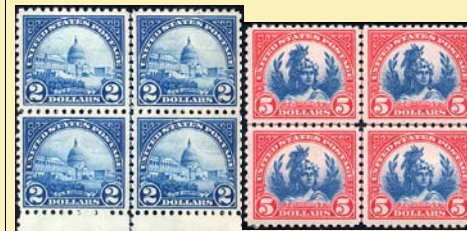
572 Arrow Block

547 $2 Franklin F-VF LH .....110.00 85.50 550* 5c Pilgrim F-VF Block 2 NH 2 OG.....175.00 90.00 550* 5c Pilgrim F-VF NH .....60.00 37.80 557* 5c Perf 11 VF NH .....48.50 34.20 558* 6c Perf 11 VF NH toned .....90.00 54.00 558* 6c Perf 11 F-VF NH .....75.00 40.50 560* 8c Perf 11 F-VF NH .....75.00 40.50 560* 8c Perf 11 VF OG .....56.50 37.80 563-71* High Values F-VF OG.....139.25 94.50 566* 15c Perf 11 VF NH .....48.50 34.20 567* 20c Perf 11 VF NH .....48.50 34.20 569* 30c Perf 11 F-VF NH .....57.50 31.50 570* 30c Perf 11 F-VF NH .....67.50 37.80 571* $1 Perf 11 VF NH .....100.00 67.50 571* $1 Perf 11 F-VF LH .....60.00 31.50 571* $1 Perf 11 VF LH P#S .....72.00 36.50