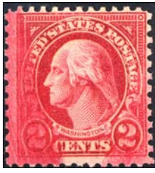
634A (5) Overinked