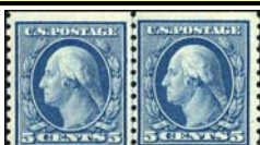
496a Line Pair sm holes