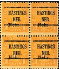
679 NH Block