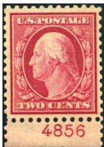
517 Grade 98J