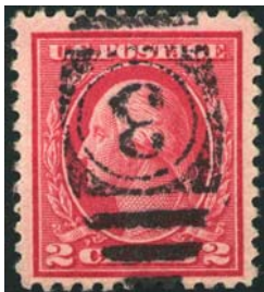
500 XF Used