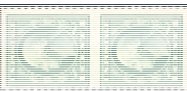
498a Imperf pair 500(1)