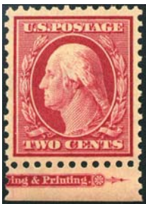
519(1) VF NH