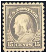
463a NH Pane