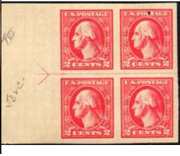
532 VF NH Block