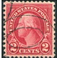
579 XF Used