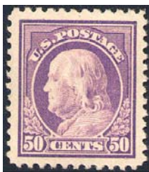
517 Grade 98J