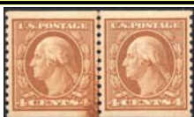
495 Line Pair Grade 80