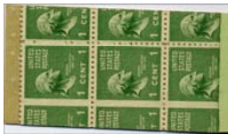
804 Misperf Booklet