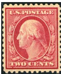
519(1) VF NH